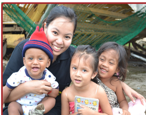
Bringing hope to the hopeless

The affects of typhoon Haiyana that swept through the central region of the Phillipines in early November 2013 was devastating. Hundreds of thousands were without power, shelter, food and water. One week after the storm hit, Firstlight International was there to help. Hundreds received aid on the northern end of the island of Cebu and on the island of Bantayon in central Phillipines. Thankful to be a part of bringing them hope!