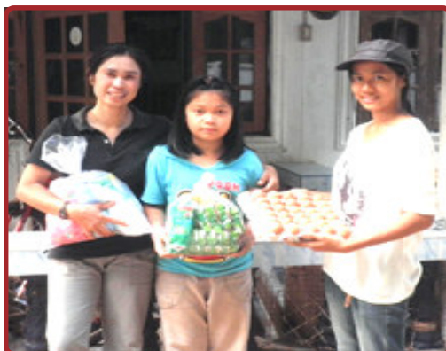
An FWF weekly home visit in Seka

What a precious sight to behold! This is one of many weekly home visits that are taking place among 86 children from fatherless homes in 6 locations this year. Each month children and families like these are receiving items like: eggs, breakfast drink mix, noodle packets, soup, shampoo and toothpaste along with school fees and related supplies twice a year. PTL!