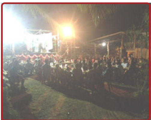
Sharing Christ during Christmas

Over Christmas, our Firstlight Fellowship Churches held Community Christmas outreaches in six locations in Thailand: 3 in the Nong Bua Lam Phu province, 2 in the Seka district, and 1 in the Khon Kaen area. PTL! There were those who came to Christ in each location as the message of the true meaning of Christmas was proclaimed during this special time of year! Joy to the world, the Lord has come!