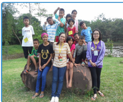
FWF Church Family Camp 2013

One of the things that keeps coming up on our radar screen in our prayer closet is: What is our part in raising up the next generation? No matter where we go children, youth, and young adults are being drawn to us. Often times, without our knowing it. It just seems to happen! So ... as spiritual parents ( Mamas & Papas ), we are taking our role seriously and we are positioning ourselves to be a part of bringing forth this next generation of Jesus lovers everywhere!