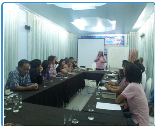
Planning Meetings Are Taking Place

If there is one thing that we are learning about church planting in Thailand is this: Every journey begins with a plan - God's plan. Therefore, it is vital that we take time regularly to pray together as a Team of leaders over these churches to find out what that plan is, and how the Lord wants to implement it. It is moments like these when collective wisdom comes forth around a common vision of what is about to take place. Plan the work!