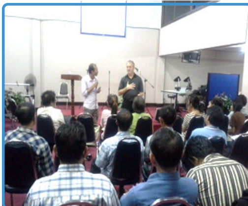
E5 Project Moves Forward For Laos

At the heart of the E5 Project is a passion for training leaders to reach the harvest and to multiply churches among responsive people. This strategy is working in many places across Asia where the E5 Project is being taught and implemented. We are excited to have the opportunity to expand into Laos to raise up more leaders, plant more churches to reach more souls.